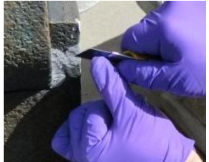
When putty partially cures, tools such as pliers or blade will help create a matching texture