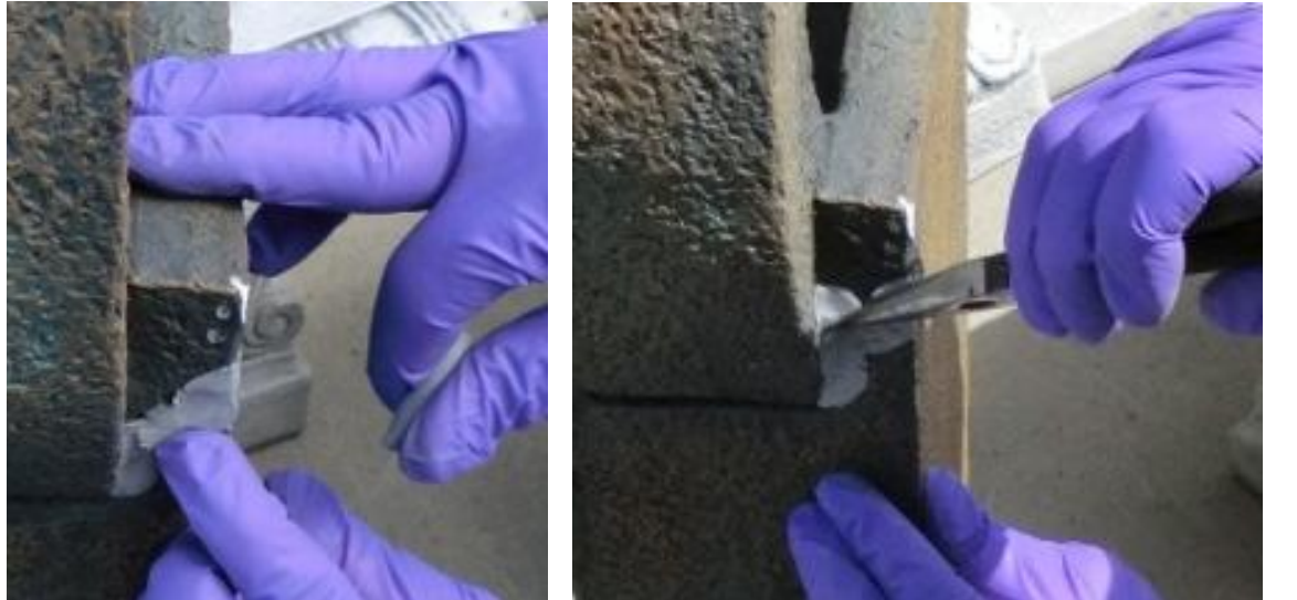
Apply putty to cover more than the affected area, pushing firmly around the edges to ensure a tight bond, and reduce the seams creating a less noticeable repair.