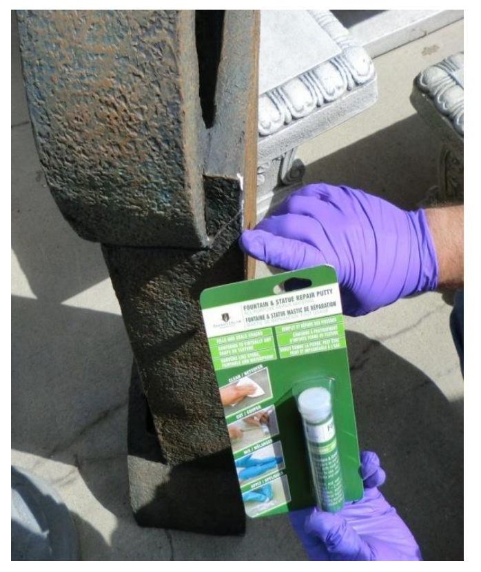
Identify the full extent of the cracked area. Clean any loose debris from affected area

Weather damage, rough handling, or neglect can cause any material to crack causing water leakage or visible imperfections. Our brand of repair putty, as well as the Oatey and JB brands, can easily repair the crack and molded to the texture of any unit. Be sure to wear gloves, and choose a well ventilated area to affect the repair.