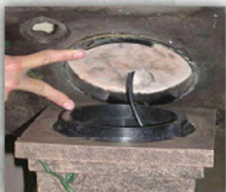
twist and lock bowl to base