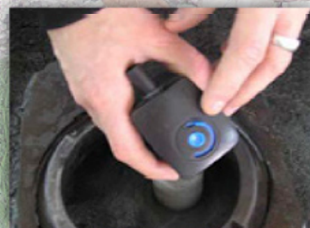
set pump to 3/4 power