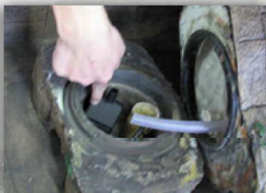
Measure the amount of tubing needed and cut excess to prevent bending