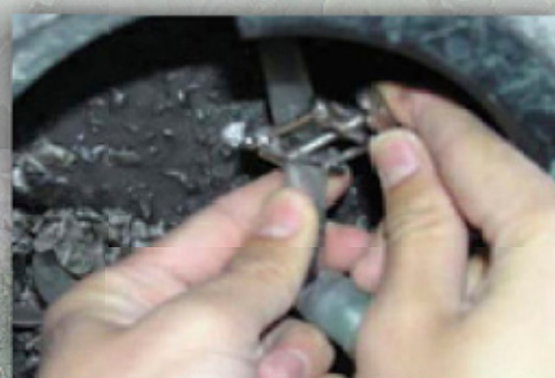
note location of restrictor to adjust flow