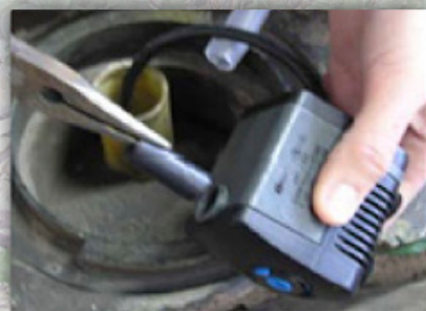
remove outlet from pump