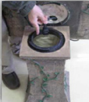
cord through bowl and into base