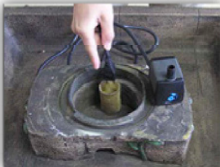
pump cord through standpipe in bowl

Thank you for buying a "Three Sisters" Fountain by Angelo Décor! We hope you will find these instructions helpful in setting up your fountain. If you have any questions with set up, parts replacement or warranty info, please, rather than returning your unit to the store, try a visit to our website, and give us a chance to help you. You will find helpful info at www.angelodecor.com First unpack carton carefully, and inspect contents carefully.