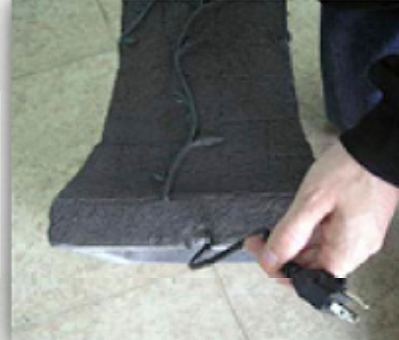
cord through bottom groove