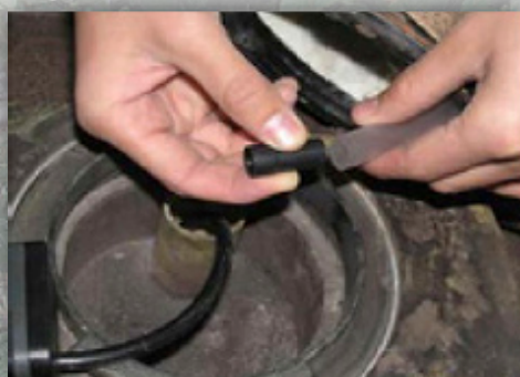
place outlet in tubing