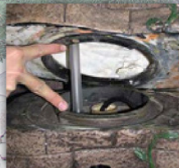
twist and lock top

Now simply fill with clean water and plug into a grounded GFCI outlet