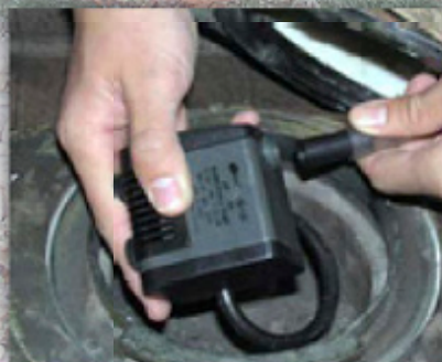
attach tubing connection to pump