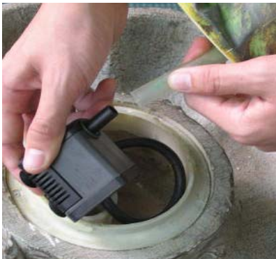
affix outlet into pump