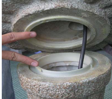
twist and lock bowl to base