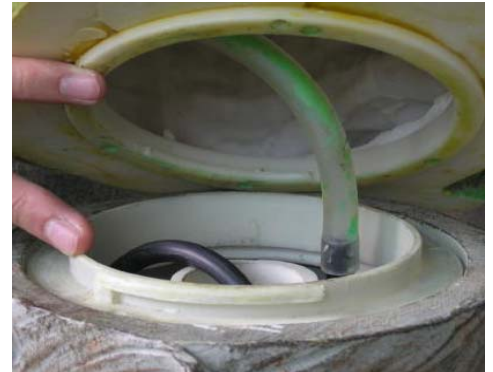
twist and lock into place

Now simply fill with clean water and plug into a grounded GFCI outlet