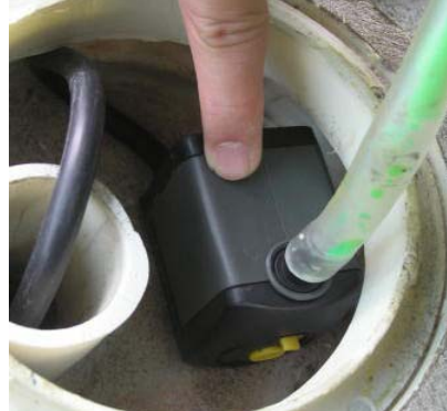
Place pump in housing, be sure not to kink hose