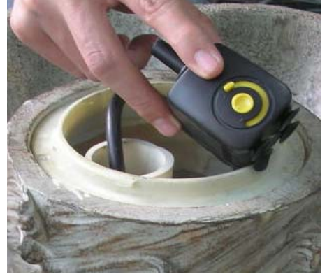
set pump flow to max