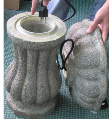
cord through pedestal