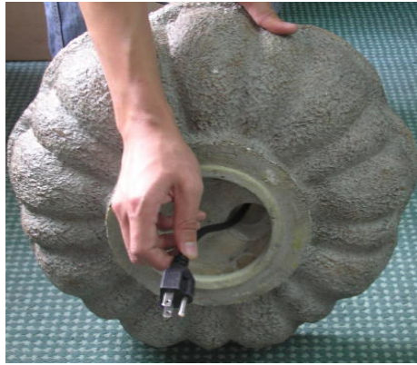
cord through bowl