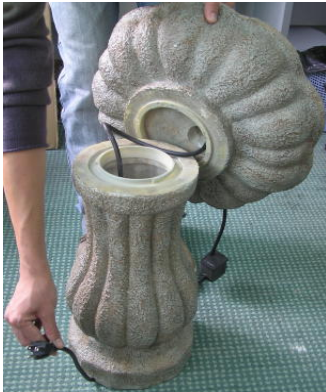
pump cord through bottom, set into grooved notch