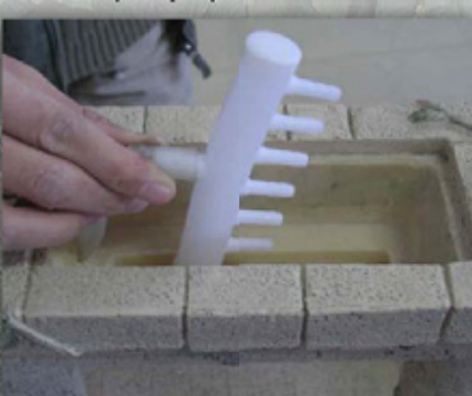
connect water spout