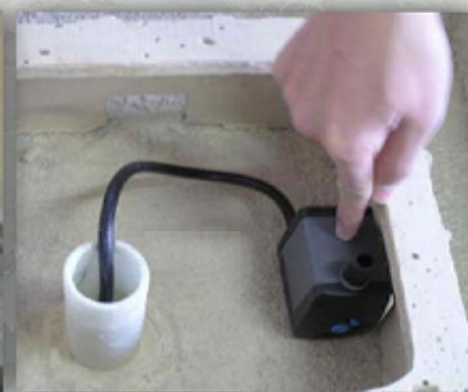
set pump upright as shown