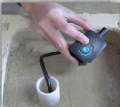
Set pump to full strength

pump cord through standpipe in bowl, then through base, out bottom into groove. Secure bowl to base with twist and lock.