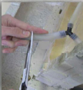
cut tubing to size