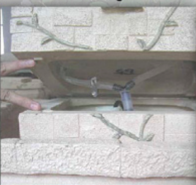
place top into position