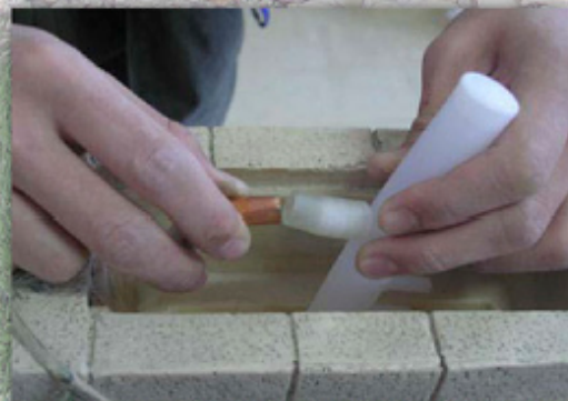
attach brass fitting