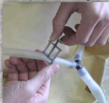
Note restrictor for fine tuning