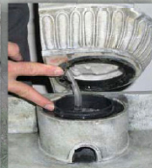
line up twist and lock