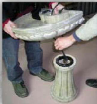
cord through bowl