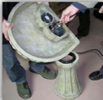
cord through standpipe

Thank you for buying a "Positano" Fountain by Angelo Décor! We hope you will find these instructions helpful in setting up your fountain. If you have any questions with set up, parts replacement or warranty info, please, rather than returning your unit to the store, try a visit to our website, and give us a chance to help you. You will find helpful info at www.angelodecor.com First unpack carton carefully, and inspect contents carefully.