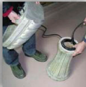
push cord to bottom