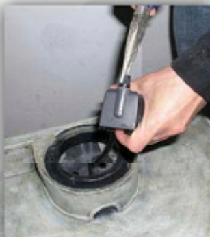
pull pump outlet out with pliers