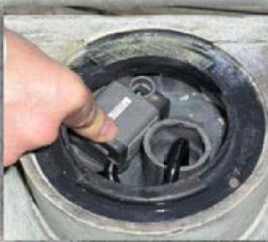
secure pump as shown