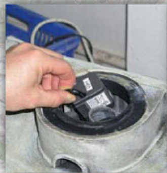
place pump in cavity as shown