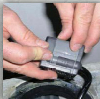
adjust pump to full strength