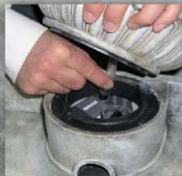
insert tubing into pump