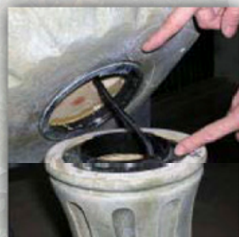
line up twist and lock, secure bowl to base