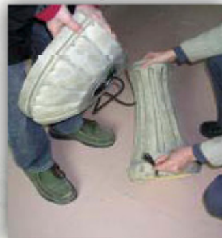
cord through bottom groove