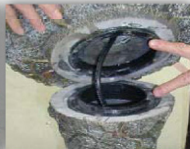
line up twist and lock, secure bowl to base