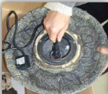
cord through standpipe

Thank you for buying a "Playtime" Fountain by Angelo Décor! We hope you will find these instructions helpful in setting up your fountain. If you have any questions with set up, parts replacement or warranty info, please, rather than returning your unit to the store, try a visit to our website, and give us a chance to help you. You will find helpful info at www.angelodecor.com First unpack carton carefully, and inspect contents carefully.