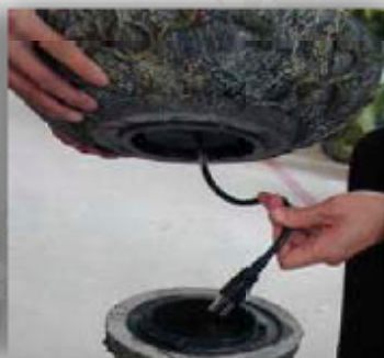
cord through bowl