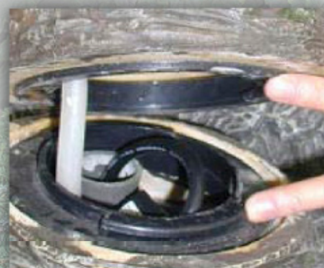
line up twist and lock, tighten into place

Now simply fill with clean water and plug into a grounded GFCI outlet. Please keep clean using a mild soap and soft cloth, and inspect pump for debris often.