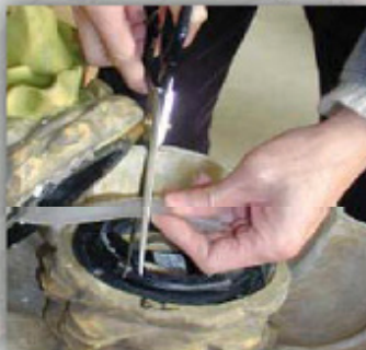
cut tubing to size (measure twice, cut once!)