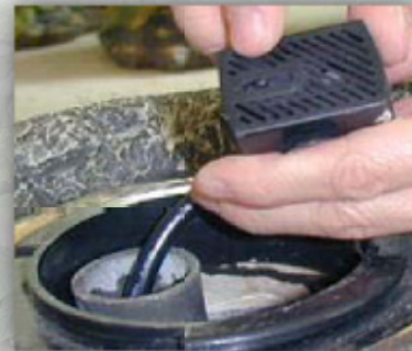
set pump to hi flow