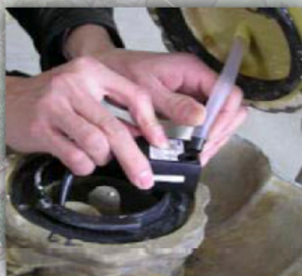
place outlet into tubing then outlet into pump