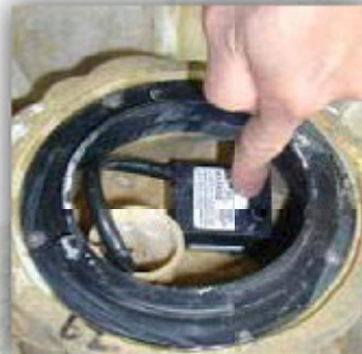
measure amount of tubing needed