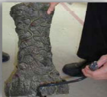
cord through bottom groove