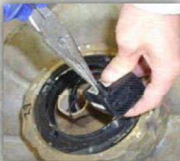
pull pump outlet out with pliers