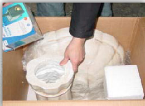
unpack with care

First unpack carton carefully, and inspect contents carefully.