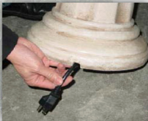
cord through bottom groove