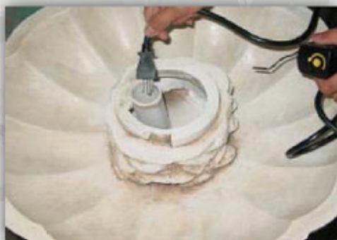
cord through standpipe