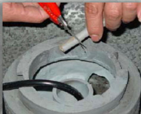
measure and cut tubing to size