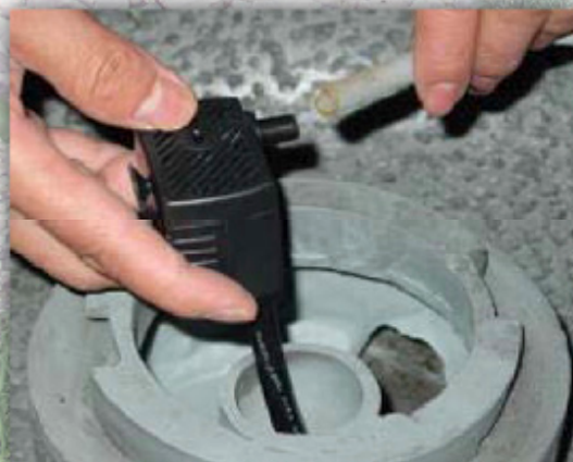
set pump to 3/4 strength connect tubing to pump