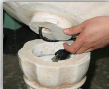
cord through bowl