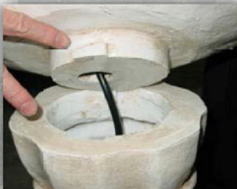
line up twist and lock,