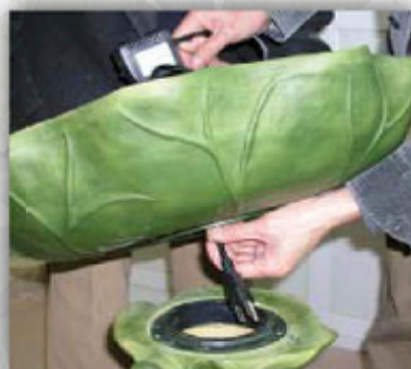
cord through bowl