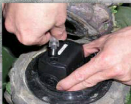
outlet into pump