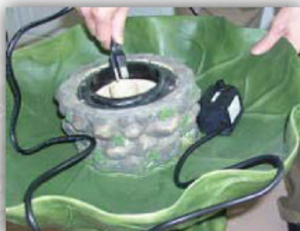
cord through standpipe

First unpack carton carefully, and inspect contents carefully.