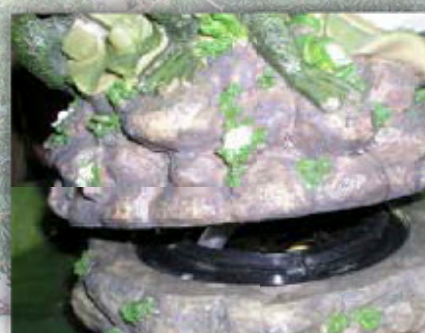
line up twist and lock, tighten into place

Please keep clean using a mild soap and soft cloth, and inspect pump for debris often.