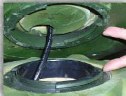
line up twist and lock, secure bowl to base