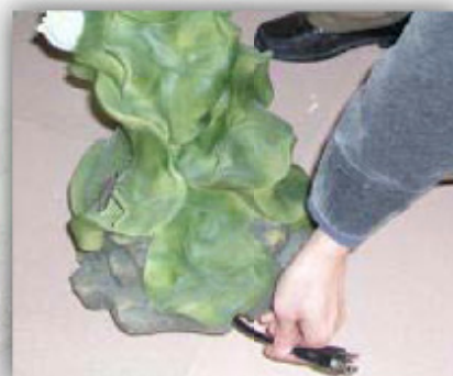
cord through bottom groove