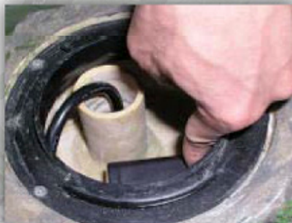
measure amount of tubing needed using finger