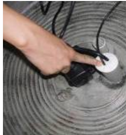
Securely install the rubber bung as shown. For the light cord, allow the cord to dip into the water before placing it down the cord pipe as shown above right. To reduce any chance of seepage, apply silicone along all seams of the rubber bung.