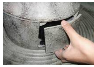
Install the pump access door.