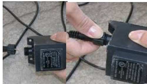
Attach light cord to transformer. Be sure it is tight. Place transformer in a secure area, preferably under cover. While this unit is rated for outdoor use, it should not be fully submersed in the water.

The final assembly should look like this →