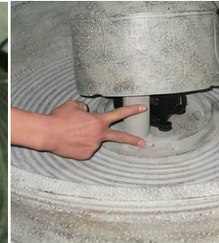
"Twist and lock" pump housing to the pool.