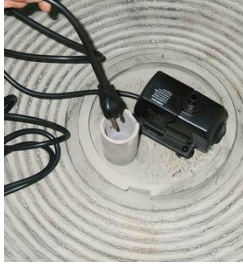
Cord through standpipe.

First unpack carton carefully, arranging parts safely in your working area.