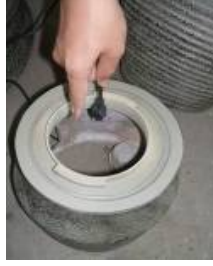
Light cord through pump cover, then through PVC pipe as shown.