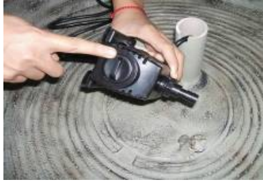
Adjust flow to desired setting.