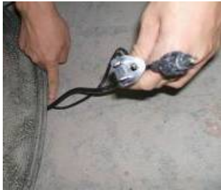
Make sure both power cords lead to groove at the bottom.