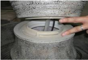
"Twist and lock" urn to the pump housing. Be sure the light cord is as shown.