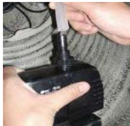
Connect pump to tubing inside pump housing.