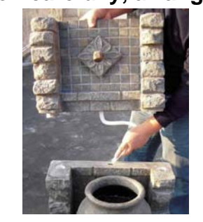
Pass the tubing down the hole in the center of the base of the fountain as shown above.