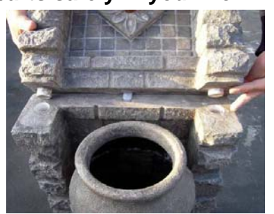
Align and set the top piece in place. Be careful not to pinch or kink the tubing.