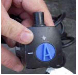
The pump is preset to full strength. If splash is a concern, adjust as needed.