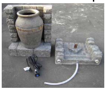
Arrange all parts in your work area.

We hope you will find these instructions helpful in setting up your fountain. If you have any issues with this item, please DO NOT return the unit to place of purchase. Please visit our web site, www.angelodecor.com, for assistance and warranty information. First unpack carton carefully, arranging parts safely in your working area.