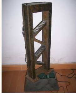
To connect the pump, set the main body at an angle on the base as shown, and connect the tubing to the pump. Set the pump to the desired setting. Place the main body on to the base.