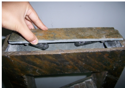
Set the top plate in place.