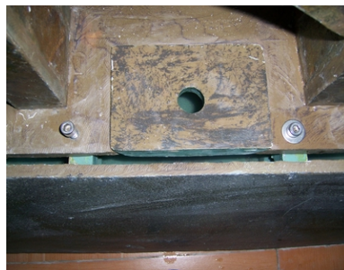
Install the pump access door.