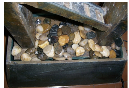
Add decorative rocks as desired.