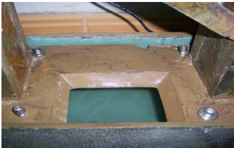
Secure the top to the base with the included screws and washers.