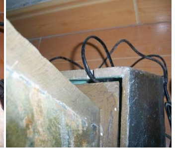
Align the cord for the light and pump with the groove as shown.