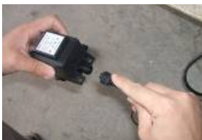
Attach the light cord to the transformer.