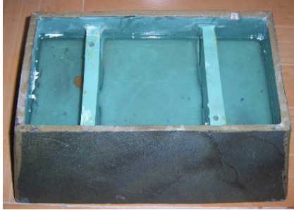
Set the base in the desired location.

This fountain is made from natural stone, setup may require 2 people.