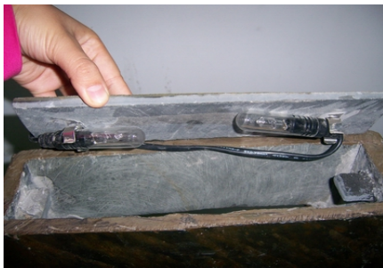
Attach the two installed lights to the top plate as illustrated above.