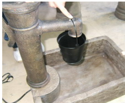
Install spill bucket using grooves. Position bucket so it will spill forward.

The final assembly should look like this