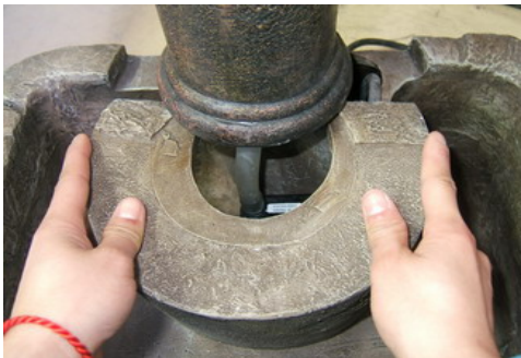
Install the pump access door. This feature makes it easier for you to clean and adjust your pump.