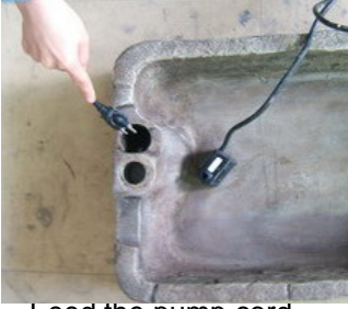
Feed the pump cord through the cord hole.

First unpack carton carefully, arranging parts safely in your working area.