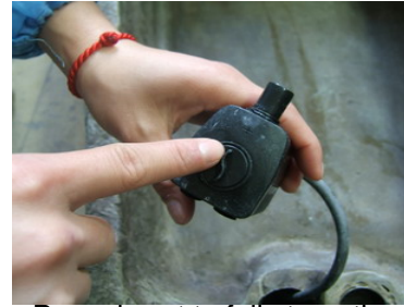
Pump is set to full strength. If splash is a concern, adjust the flow as desired.