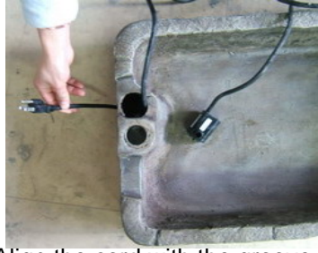
Align the cord with the groove at the base of the bowl.