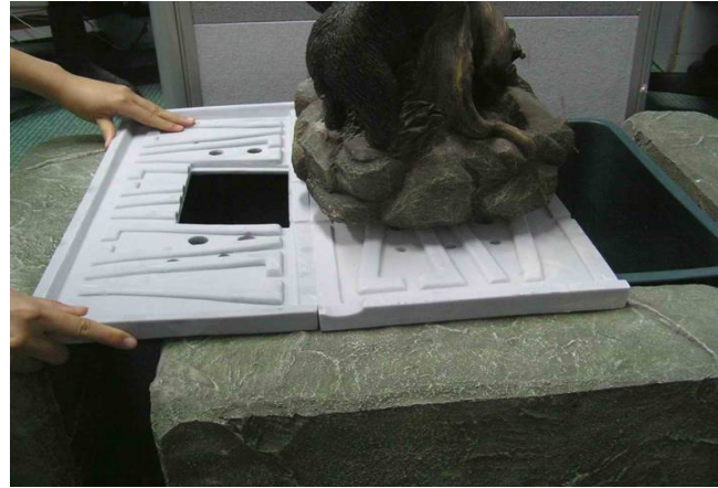
Install remaining side plates (2).