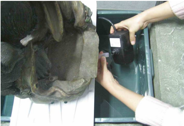
Connect tubing from feature to pump outlet.

We hope you will find these instructions helpful in setting up your fountain. If you need more information to properly care for your fountain, please DO NOT return the unit to place of purchase. Please visit our web site, www.angelodecor.com , for assistance and warranty information.