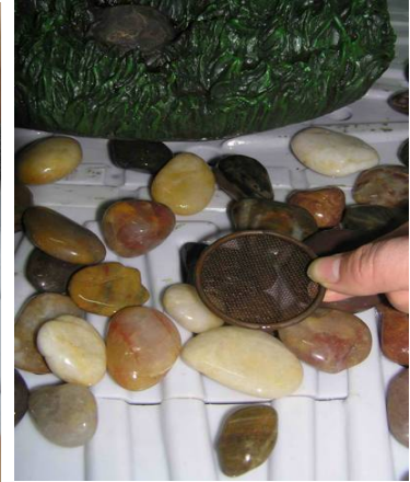
Install pump access door. Using tube provided, apply silicone along seams. Add decorative rocks on top of tray.