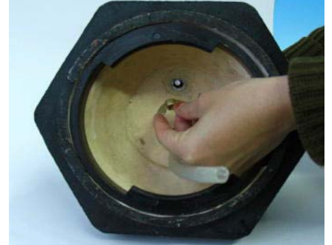
attach nut (provided)