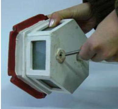
Insert screw (provided) into top

Carefully unpack the unit placing parts securely in your work area. Feed pump cord through pipe in bowl, run through pedestal, and pull out cord slack. Fit cord in groove at bottom. Line up twist and lock and attach.