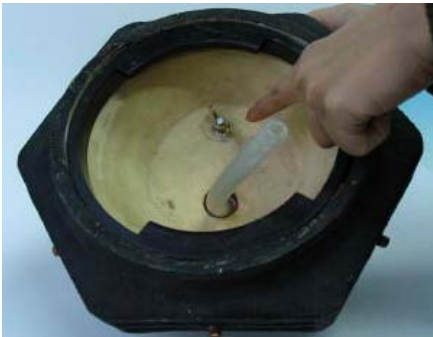
tighten nut firmly