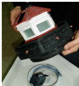
position top together as shown