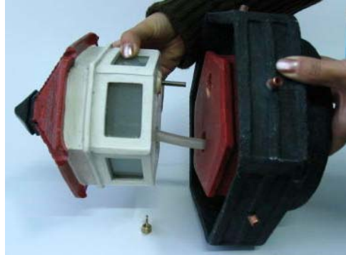
position top onto spill bowl