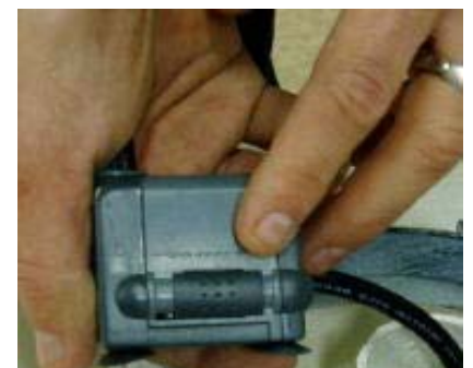
Set pump to 3/4 strength