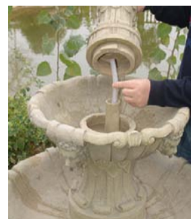
Feed the tubing up and through the second riser.