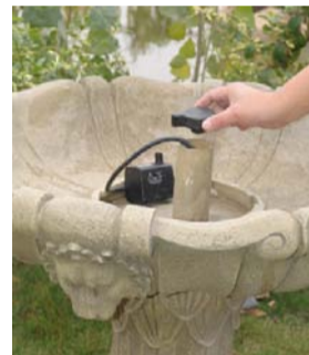
Install the cord pipe cover by aligning the cord then fitting it in to the pipe.