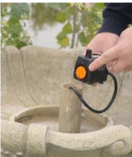
The pump is preset to full strength. If splash is a concern, adjust as needed.