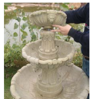
Set the small bowl in place and twist and lock it to the second riser.