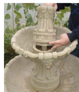
Lower the second riser in place and twist and lock it to the second bowl.