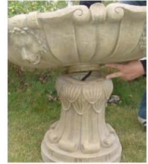
Carefully lower the bowl on to the pedestal. Align the grooves, then twist and lock the large bowl to the pedestal.