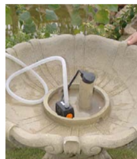
The pump should sit flat inside the bowl as shown above. Attach the included tubing to the pump.