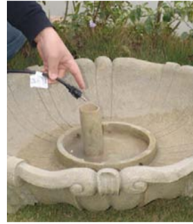
Pass the power cord down the cord pipe in the large bowl.