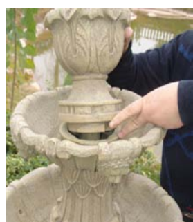
Align the top then lower and secure it to the small bowl.