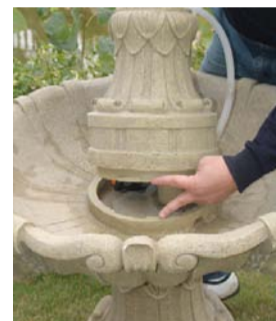
Set the pump housing / riser into place, align the grooves then twist and lock it to the bowl.