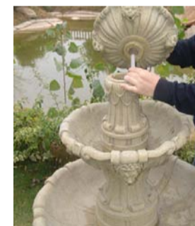
Feed the tubing up through the small bowl.