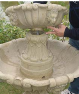
Align the grooves then lower and twist and lock the second bowl to the riser.