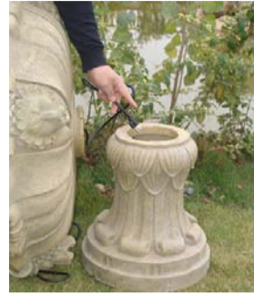
Carefully rest the bowl on its side. Feed the pump cord down the pedestal and out the base.