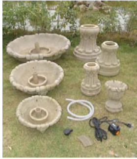
Arrange all pieces in your workspace.

First unpack carton carefully, arranging parts safely in your working area.