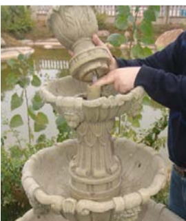
Connect the tubing to the top.