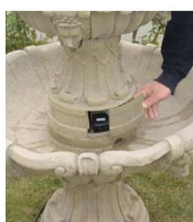
Check to ensure the tubing is still properly attached to the pump and install the pump access door. This feature makes it easier for you to clean and adjust your pump.

The final assembly should look like this →