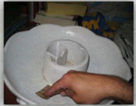
Thoroughly sand the bowl.