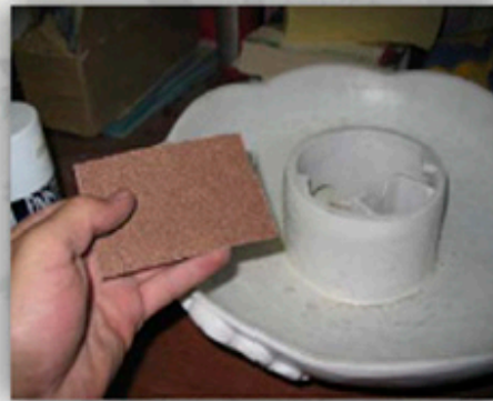
Cut small piece of sandpaper