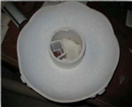
Sand until smooth, removing all loose paint