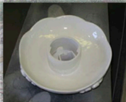
A final coat of paint sealer or waterproofing should be applied to protect the repaired product.

While each scenario may vary, these general steps can be followed to achieve a "like new" finish for most paint repairs.