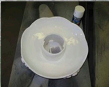
Apply two more coatings, allowing sufficient time to dry between coats