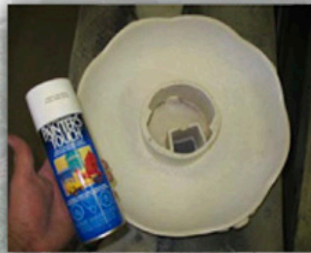
Wipe bowl clean of debris. Find suitable match in colour.