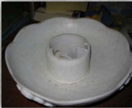
Clean affected bowl

Many paint and craft stores sell a variety of colors that may provide a close match to your unit. Any brand will suffice, and if painting the entire inside of the bowl as pictured below, the exactness of the color match is not critical. The objective is to get it back in action!