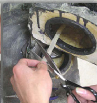
cut tubing to size (measure twice, cut once!)