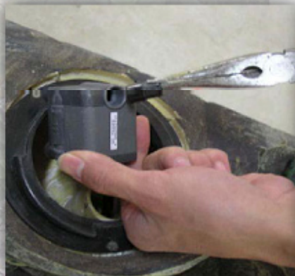
pull pump outlet out with pliers