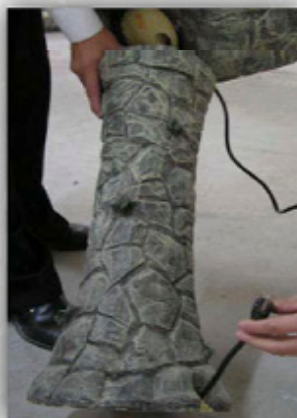
cord through bottom groove