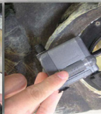
set pump to 3/4 flow