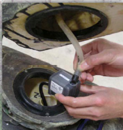
place outlet into tubing, then outlet into pump