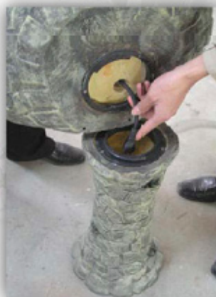
cord through bowl