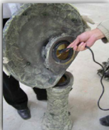
cord through standpipe

Thank you for buying a "Mamma Bears" Fountain by Angelo Décor! We hope you will find these instructions helpful in setting up your fountain. If you have any questions with set up, parts replacement or warranty info, please, rather than returning your unit to the store, try a visit to our website, and give us a chance to help you. You will find helpful info at www.angelodecor.com First unpack carton carefully, and inspect contents carefully.