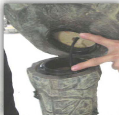
line up twist and lock, secure bowl to base