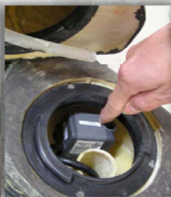
measure amount of tubing needed