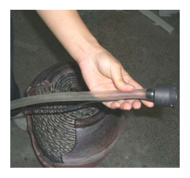
Locate the light and tubing shown above.

First unpack carton carefully, arranging parts safely in your working area.