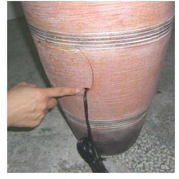
Install the pump access door. the cord should pass through as shown above right.