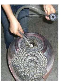
Pass the tubing and light cord through the opening at the top. Connect the light cord to the pump as shown.