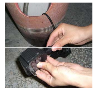
Attach the tubing to the pump. Attach the cord to the transformer. Ensure it is tight. Place the transformer in a safe area, preferably under cover. While this unit is rated for outdoor use, it should not be fully submersed in the water.