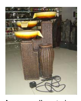
Arrange all parts in the work area.

First unpack carton carefully, arranging parts safely in your working area.