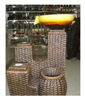
The top bowl should look like this when set in place.