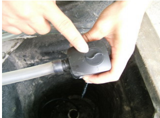
Pump is preset to full, adjust lower if less splash is desired.