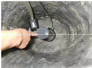
Cover pipe by firmly fitting rubber cap on pipe.