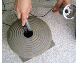
Pass the supplied light cord and tubing through the opening in the orb.