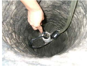
Feed the pump and light cord through the cordpipe in the base. Align the cord with the groove at the base.