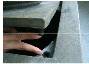
Align the metal pin with the fitting and set the top in place.