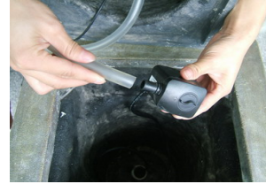
Connect tubing to the pump.