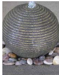
Add decorative rocks for finished look.