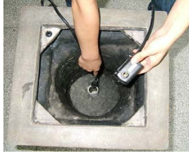
Pump cord go through the cordpipe

First unpack carton carefully, arranging parts safely in your working area.