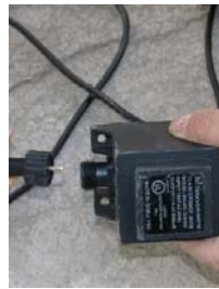
Attach light cord to transformer. Be sure it is tight. Place transformer in a secure area, preferably under cover. While this unit is rated for outdoor use, it should not be fully submersed in the water.