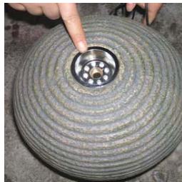
Firmly press the light and holder into place as shown.