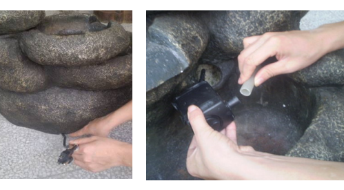
Connect the tubing to the pump.