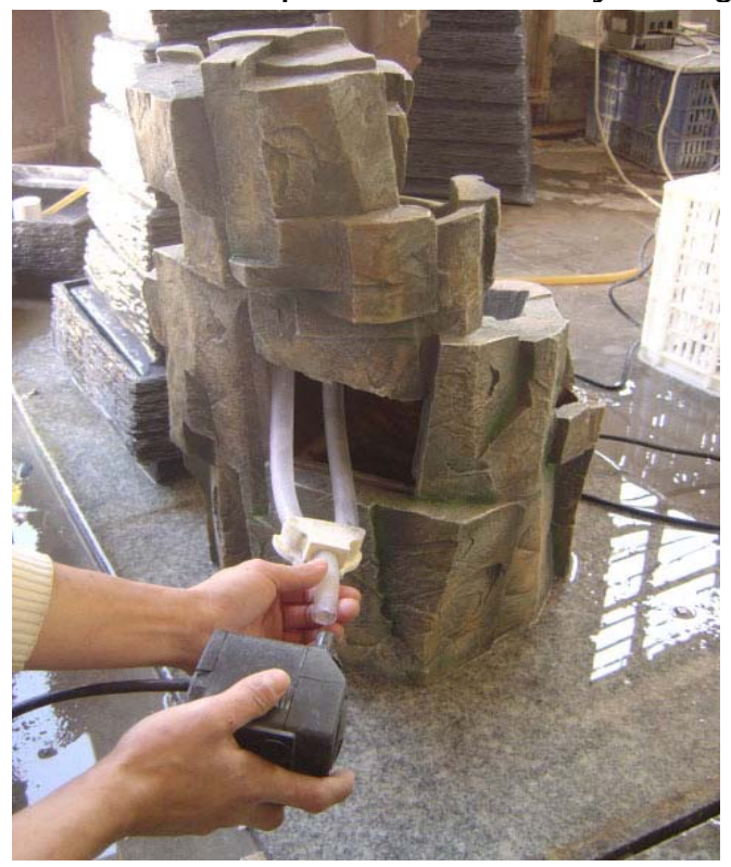
Connect the pump to the pre-installed tubing. Set the pump inside the rear access hole, and set firmly in place.

First unpack carton carefully, arranging parts safely in your working area.