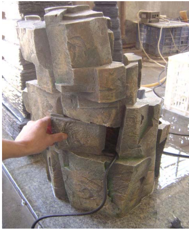
Install the pump access door.