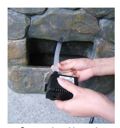
Connect the tubing to the pump as illustrated above.