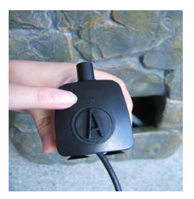
Pump is set to full. Reduce flow if lower splash is desired