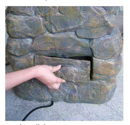
Install the pump access door