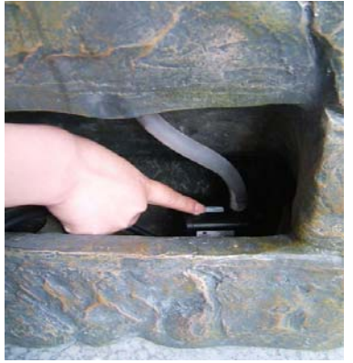
Pump should sit flat and move free inside pump house.