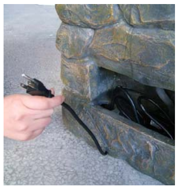
Align the pump cord with the groove at the base.