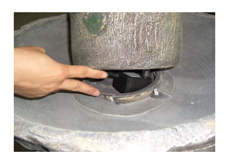
Twist and lock the top into place.