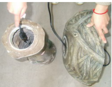
Pass the cord down the pedestal, and align with groove at the base.