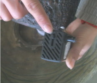
Pump is preset to full just lower if less splash is desired.