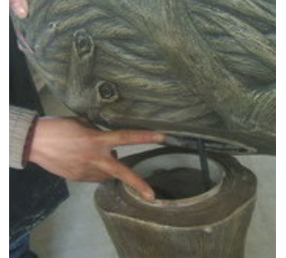
Twist and lock bowl to base.