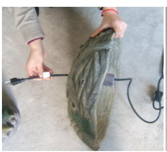
Pass the cord through the bowl.