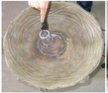
Feed the cord through the cord pipe.

First unpack carton carefully, arranging parts safely in your working area.