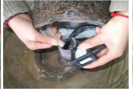
Connect the tubing to the pump,be sure it sits flat inside the housing without any kink in the hose.