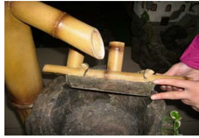
Set the bamboo tray into place as shown above left. Carefully set the "tipping" bamboo place into the holder as shown above right. You may need to do some slight adjusting in this step to get the tipping rhythm just right.