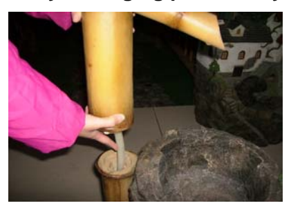
Feed the tubing attached to the top piece through the opening as shown above.