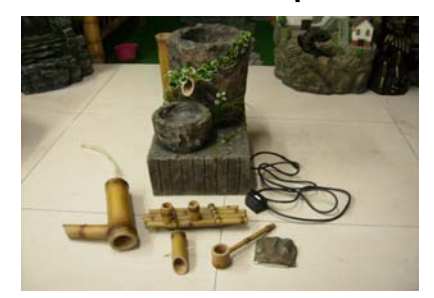
Unpack and arrange all parts.

First unpack carton carefully, arranging parts safely in your working area.