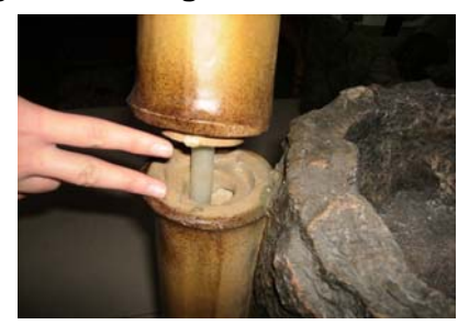
Set the top section of the bamboo into place by lowering and turning to lock in place.