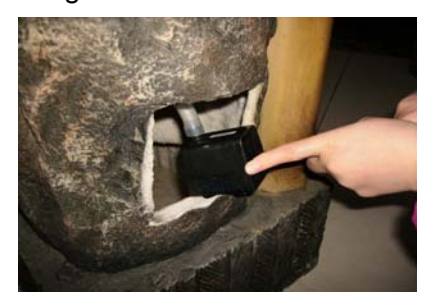
Place the pump inside the reservoir being certain it is fully submersed, sitting flat and the tubing is not kinked.