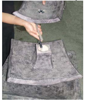
Pass the light cord and tubing through the opening of the top piece. Press the light

We hope you will find these instructions helpful in setting up your fountain. If you have any issues with this item, please DO NOT return the unit to place of purchase. Please visit our web site, www.angelodecor.com, for assistance and warranty information. First unpack carton carefully, arranging parts safely in your working area.