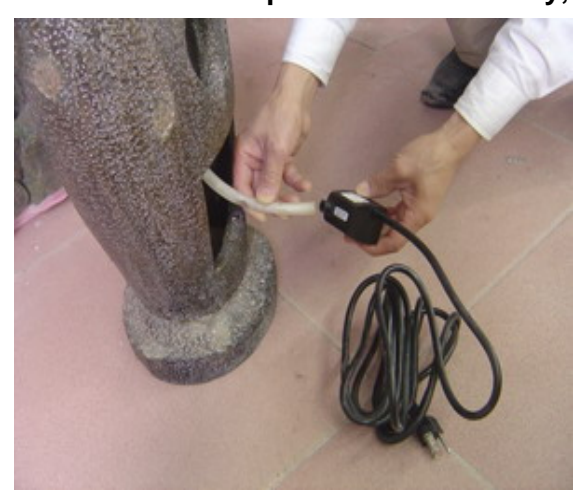
Connect tubing to the pump.

First unpack carton carefully, arranging parts safely in your working area.