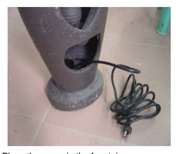
Place the pump in the fountain.