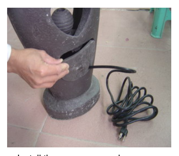
Install the pump access door.