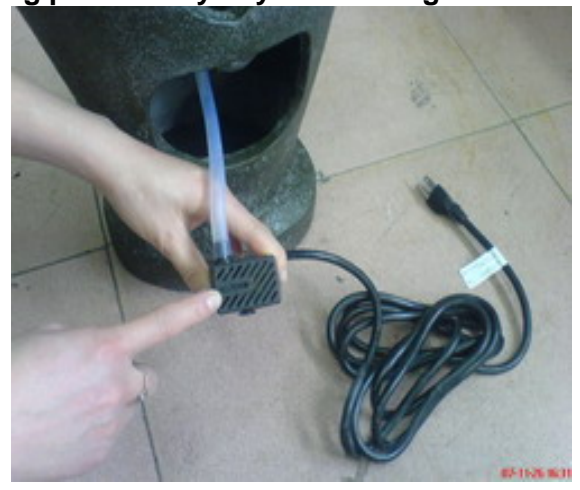
Pump is set to full. Reduce flow if lower splash is desired.