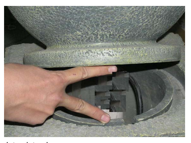
Attach tubing to pump, twist and lock top into place.