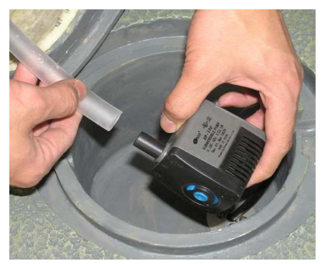
Pump is pre installed. Note flow control to adjust. We recommend full strength setting for maximum effect, but you may want to adjust downward in areas where splashing is a concern.