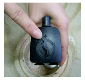
power. If splash is a concern, reduce the amount of flow.