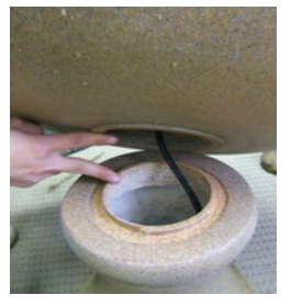
Twist and lock the bowl The pump is set to full to the pedestal.