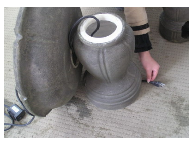
Pass the pump cord through the pedestal and align the cord with the groove at the base.