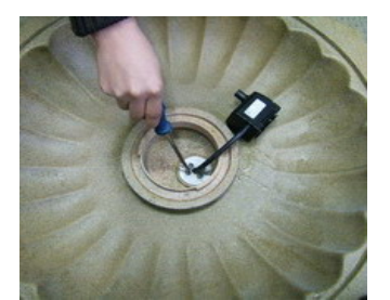
Ensure the cord seal is secure and tight.

We hope you will find these instructions helpful in setting up your fountain. If you have any issues with this item, please DO NOT return the unit to place of purchase. Please visit our web site, www.angelodecor.com, for assistance and warranty information. First unpack carton carefully, arranging parts safely in your working area.