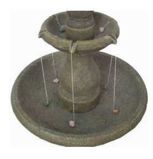
This fountain comes complete with our innovative splash reduction system. If splash is a concern, simply drape the splash line over each spill point to dramatically reduce splash.