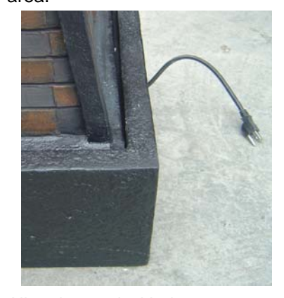
Align the cord with the groove at the base.