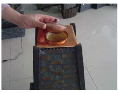
Your fountain includes an optional fire feature which should be installed as shown to the left. Please use EXTREME CAUTION when using this device and follow all cautions and warnings included with this device.