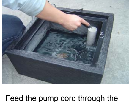
cord pipe as shown above.