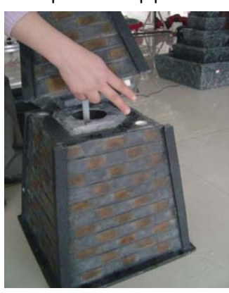
Place the top piece on to the middle section by aligning the slip mechanism as illustrated.