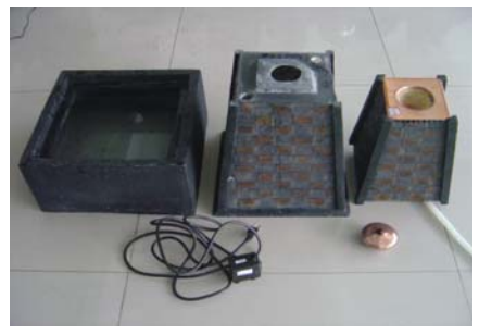
Arrange all parts in your working

First unpack carton carefully, arranging parts safely in your working area.