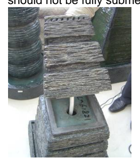
Set the middle section in place, followed by the top piece. Feed the pump tubing down through the middle section as shown.