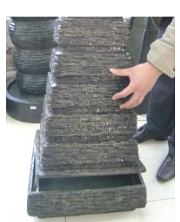
Tilt the middle and top sections together and connect the tubing to the pump.