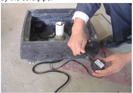
Attach light cord to transformer. Be sure it is tight. Place transformer in a secure area, preferably under cover. While this unit is rated for outdoor use, it should not be fully submersed in the water.