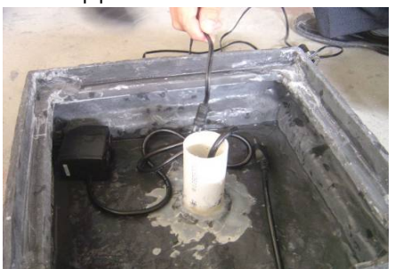
Feed the light cord down through middle section of the fountain followed by the cord pipe.