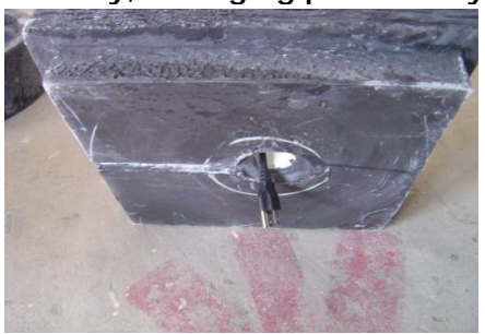
Retrieve the cord from the base and align with the groove at the bottom.