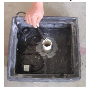
Feed the pump cord down through the cord pipe.

First unpack carton carefully, arranging parts safely in your working area.