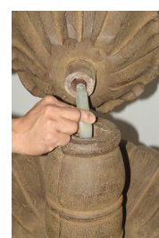
The riser is installed next. After feeding the tubing through the riser, slide it in place with the grooves aligned.