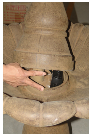
Set the pump housing / riser into place by aligning the grooves.