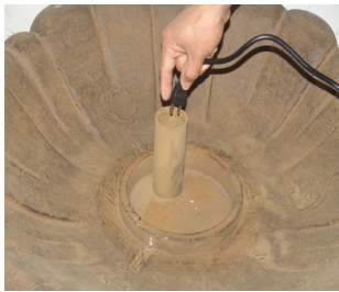
Feed the cord through the cord pipe.

First unpack carton carefully, arranging parts safely in your working area.