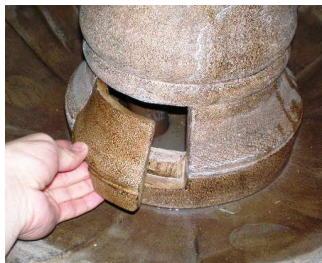
Check to ensure the tubing is still properly attached to the pump and install the pump access door. This feature makes it easier for you to clean and adjust your pump.