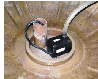
The pump should sit flat inside the bowl as shown above. Attach the included tubing to the pump.