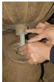
Feed the tubing up the pump housing / riser and pass it through the middle of the second bowl.