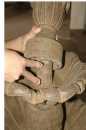
Align the grooves and set the top in place.