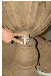
Set the second bowl in place by aligning the grooves.