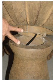
Carefully place the large bowl on the pedestal by aligning the grooves as shown.