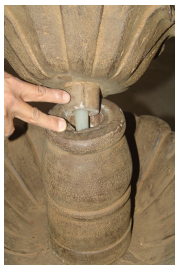
Pass the tubing through the last bowl and set in place with grooves aligned.