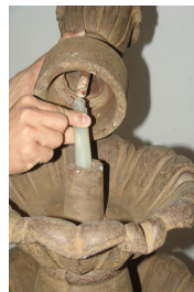
Connect the tubing to the top piece.