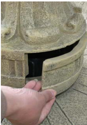
Attach tubing to pipe in top. Twist and lock into place. Now you can connect tubing to pump in bottom housing. Pump should sit squarely in housing as shown. Add access door into place.

Now simply fill with clean water and plug into a grounded GFCI outlet We recommend keeping bowl 3/4 full of water to avoid pump burnout.