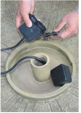
remove pump plate for best results