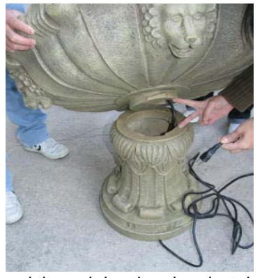
cord through bowl and pedestal