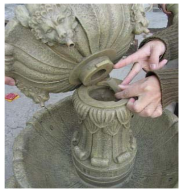
place tubing into riser as shown, and add the other parts, fitting them into place, while feeding tubing through to top