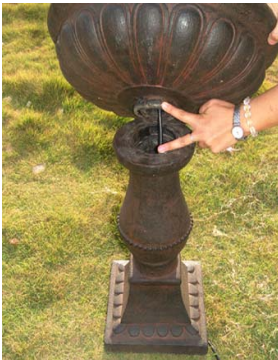
Carefully lower the bowl on to the pedestal. Align the grooves, then twist and lock the bowl to the pedestal.