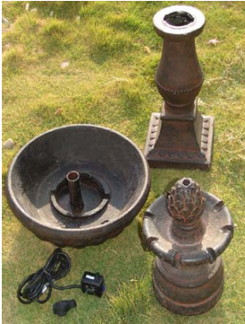
Arrange all pieces in your workspace.

First unpack carton carefully, arranging parts safely in your working area.