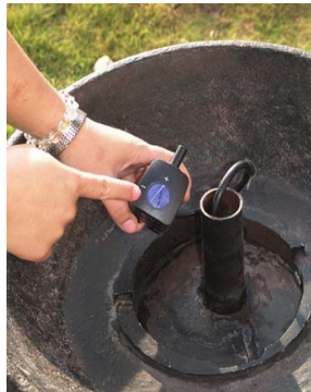
The pump is preset to full strength. If splash is a concern, adjust as needed.