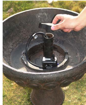
Install the cord pipe cover by aligning the cord then fitting it in to the pipe.