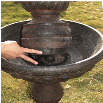
Gently lower the top in place. Align the grooves and twist to lock in place. Be careful not to kink the tubing or pinch the cord in the locking ring.

The final assembly should look like this →