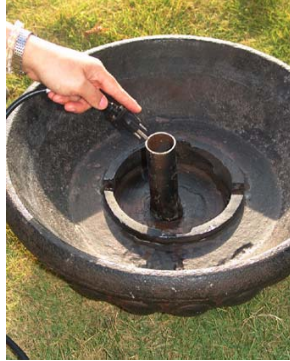
Pass the power cord down the cord pipe in the bowl.