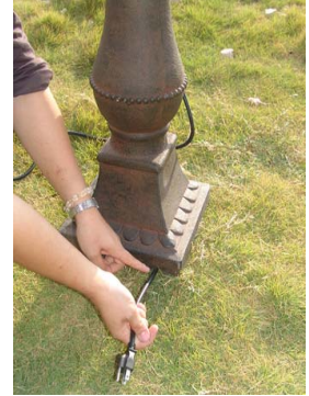
Align the pump cord with the groove at the base of the pedestal.