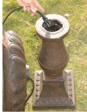
Carefully rest the bowl on its side. Feed the pump cord down the pedestal and out the base.