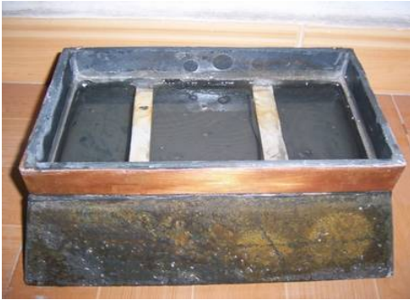
Set the base in place.

First unpack carton carefully, arranging parts safely in your working area. This fountain is made from natural stone, setup may require 2 people.