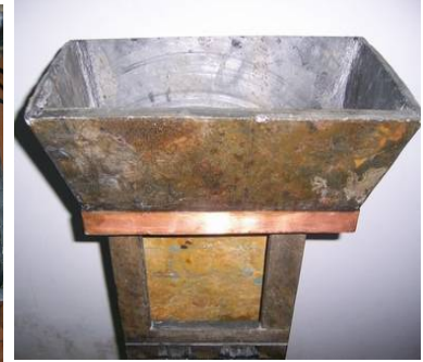
Set the top in place.