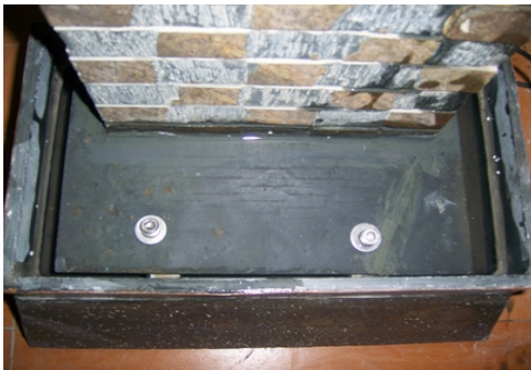
Secure the main body to the base using the screws and washers included as shown above.