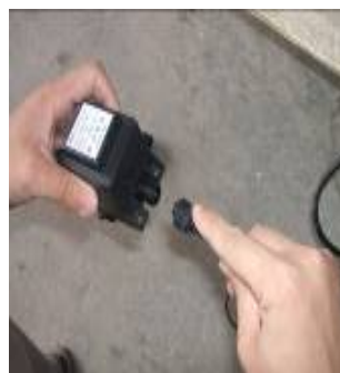
Attach the light cord to the transformer as shown above.