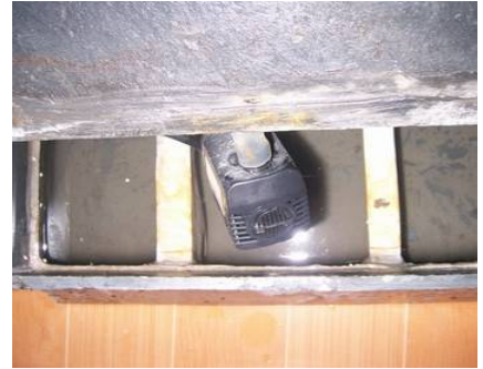
Lower the main body onto the base with the pump attached as shown.