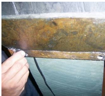
Secure the top in place at the rear using the included screws and washers as illustrated.