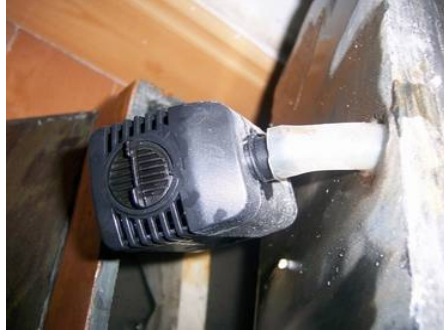
Connect the pump to the tubing exiting the main body of the fountain.