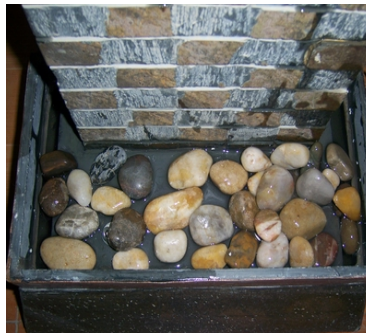
Add decorative rocks as desired.