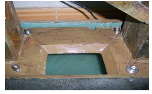
Secure the top to the base with the included screws and washers.