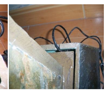
Align the cord for the light and pump with the groove as shown.