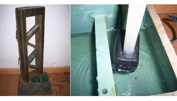
To connect the pump, set the main body at an angle on the base as shown, and connect the tubing to the pump. Set the pump to the desired setting. Place the main body on to the base.