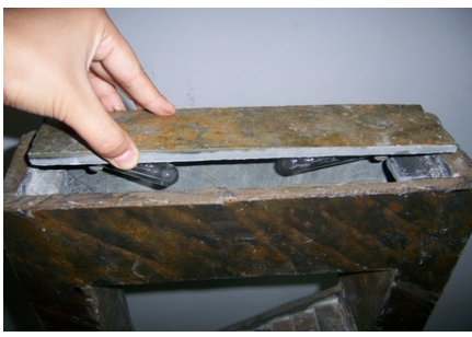
Set the top plate in place.