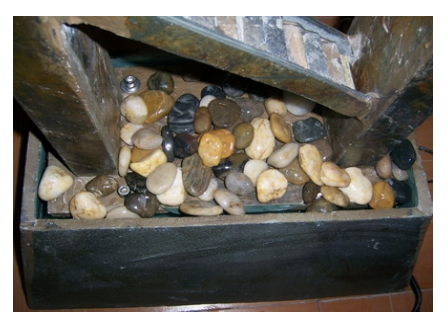
Add decorative rocks as desired.