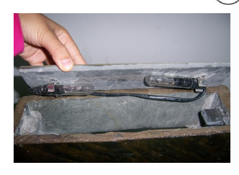
Attach the two installed lights to the top plate as illustrated above.