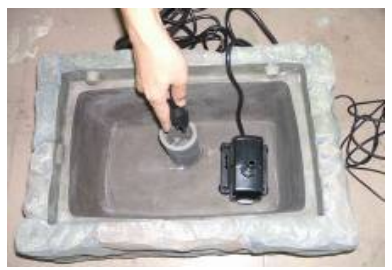
Pump cord through standpipe.

Thank you for buying an Angelo Decor Fountain! We hope you will find these instructions helpful in setting up your fountain. If you need more information to properly care for your fountain, please DO NOT return the unit to place of purchase. Please visit our web site, www.angelodecor.com, for assistance and warranty information. First unpack carton carefully, arranging parts safely in your working area.