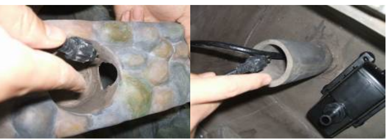
Run the light cord through the cover plate, then through PVC pipe.

Attach light cord to transformer. Be sure it is tight as shown. Place transformer in secure area, preferably under cover. While this unit is rated for outdoor use, it should not be fully submersed in the water.