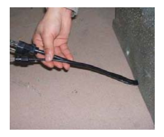
Make sure both power cords go through the groove at base.