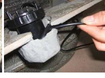
Set the light into the groove of cover plate