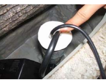
Insert rubber bung as shown.