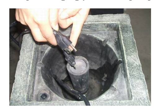
Pump and light cords through PVC pipe