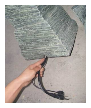
Lead the cords to the groove at bottom.