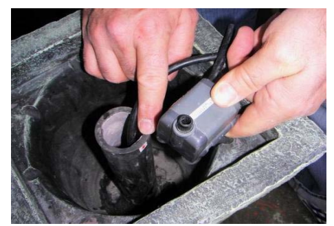
Be sure pump line up with arrow for proper fit at bottom of reservoir