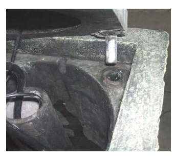
Secure bowl into place with metal " slip fit " fixture