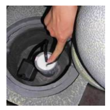
Insert rubber stopper as shown.