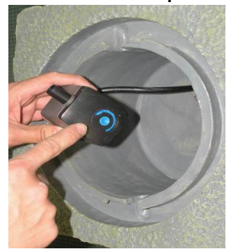
Adjust flow to desired

First unpack carton carefully, arranging parts safely in your working area.