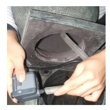
Connect tubing to the pump