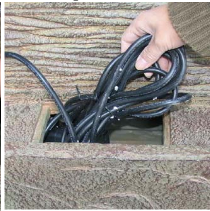
Remove all packing and parts from inside unit. Be sure to get all foam packing out. Set all parts safely in front. The pump unit has been "pre installed" for your convenience.