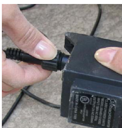
Pump should sit as shown. Feed light wire through unit, and attach securely to the transformer as shown.