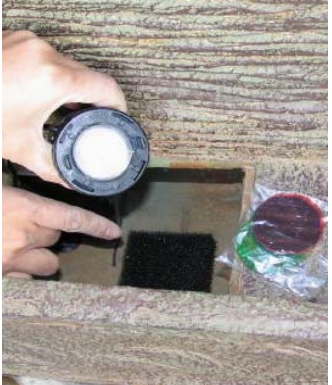
Set light unit in as shown. We suggest using the pump filter as a riser for better light effect.