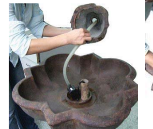
Tubing go through the riser. And twist and lock riser to the bowl.