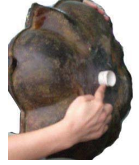
Insert the supplied PVC pipe to the middle bowl as