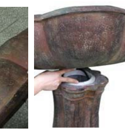
Twist and lock bowl to pedestal.

Pass the pump cord through the pedestal. Align the cord with the groove at the base.