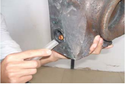
Conect tube to top