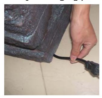
Feed the power cord through the base