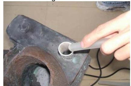
Go the tube through PVC pipe