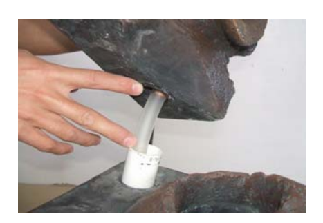
Slide top into place