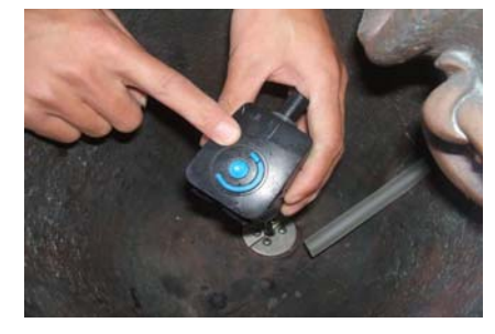
Adjust pump to desired setting.