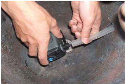
Connect tubing to the pump