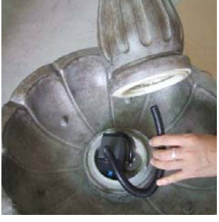
Connect tubing to pump. Run tubing up through the riser.