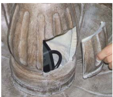
Install pump access door.