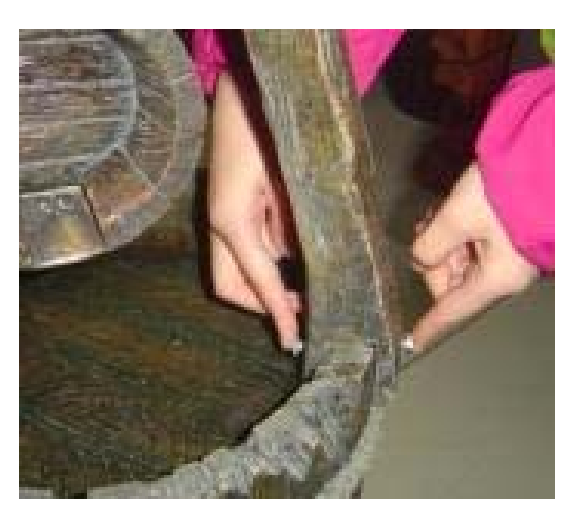
Top water feature attached securely in place.