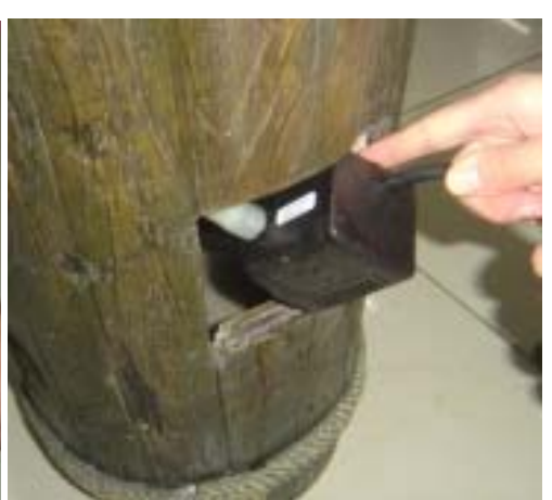
Pump installed into with all cord outside of unit.