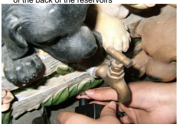
Connect the tubing to the pump