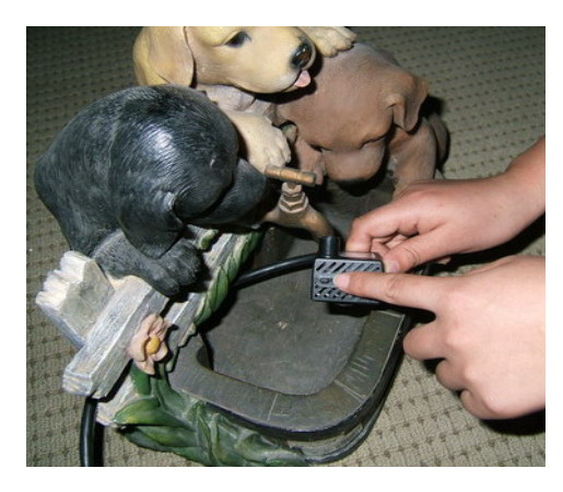
Set the pump to the desired setting