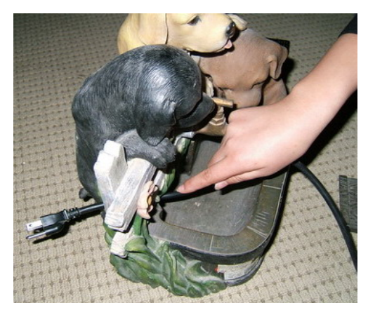
Pump cord go through the groove of the back of the reservoirs

First unpack carton carefully, arranging parts safely in your working area.