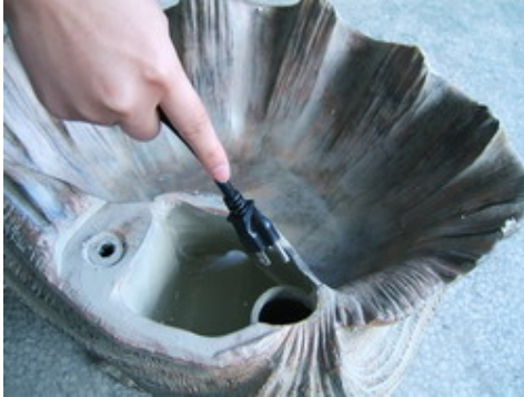
Feed pump cord through cord pipe and down along the base of the fountain.

First unpack carton carefully, arranging parts safely in your working area.