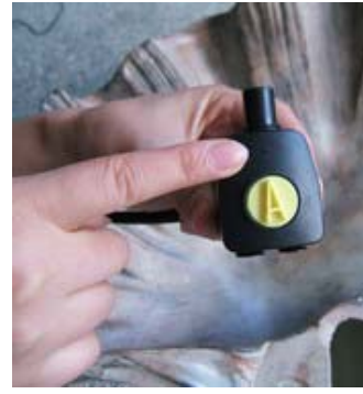
Pump is set to full. Reduce flow if lower splash is desired.