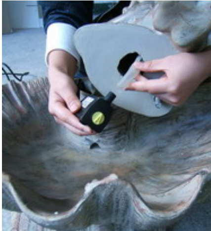
Connect the tubing to the pump.