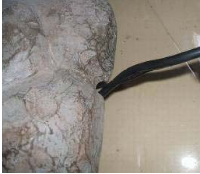
Align pump cord with groove at the base.