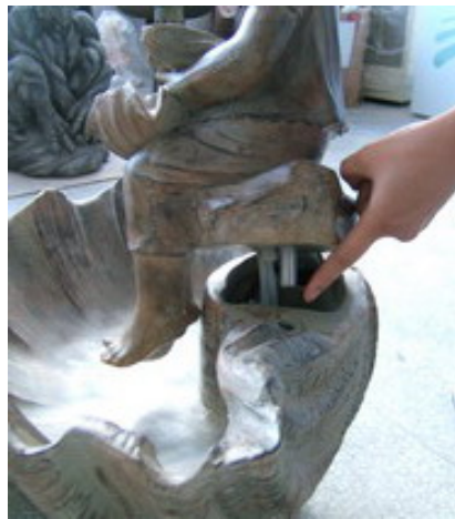
Slide the top piece in place as shown above.

Note: When installing and removing the top piece for maintenance, be certain to lift straight up. Twisting or bending the joint can cause stress or damage to the slip fit mechanism.