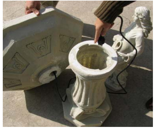
cord goes through bowl and pedestal, and bowl locks into place