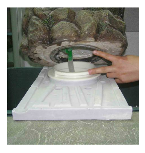
Twist and secure feature into place.