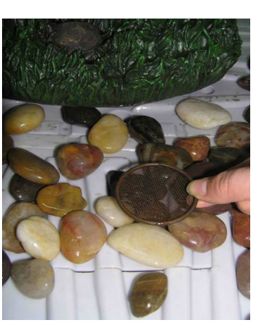
Install pump access door. Using tube provided, apply silicone along seams. Add decorative rocks on top of tray.