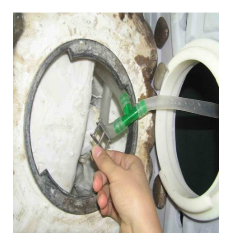
A restrictor has been provided which may need to be adjusted to control flow