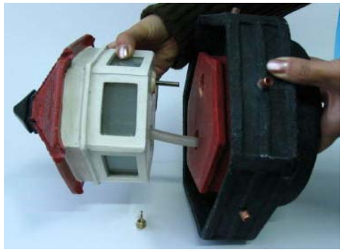
position top onto spill bowl