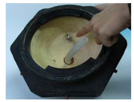
tighten nut firmly