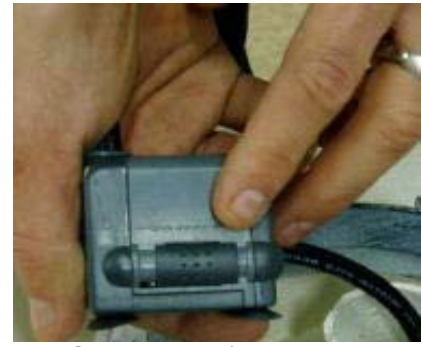
Set pump to 3/4 strength