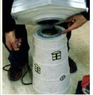
Carefully unpack the unit placing parts securely in your work area. Feed pump cord through pipe in bowl, run through pedestal, and pull out cord slack. Fit cord in groove at bottom. Line up twist and lock and attach.