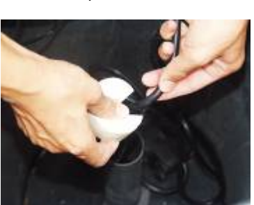
Install the cord seal, as shown.