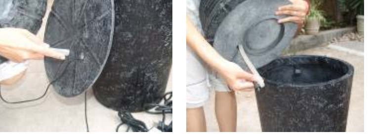
Feed the power cord for the lights and the tubing through the access hole in the insert plate, as shown