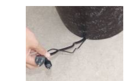
Align the pump cord and the power cord for the lights along the groove, and feed the power cord down through the cord pipe at the base of the fountain.