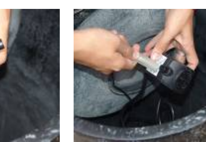
Connect the tubing to the pump.

This fountain should be stored during the winter, because water that is left to freeze in the reservoir may cause cracking. Disassemble the fountain, remove the pump and all water, and store it in a garage or shed.