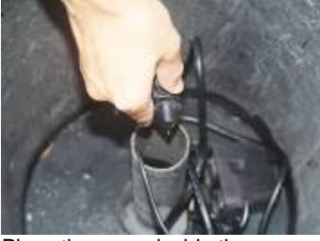
Place the pump inside the reservoir. Feed the light and pump cords down through the cord pipe.